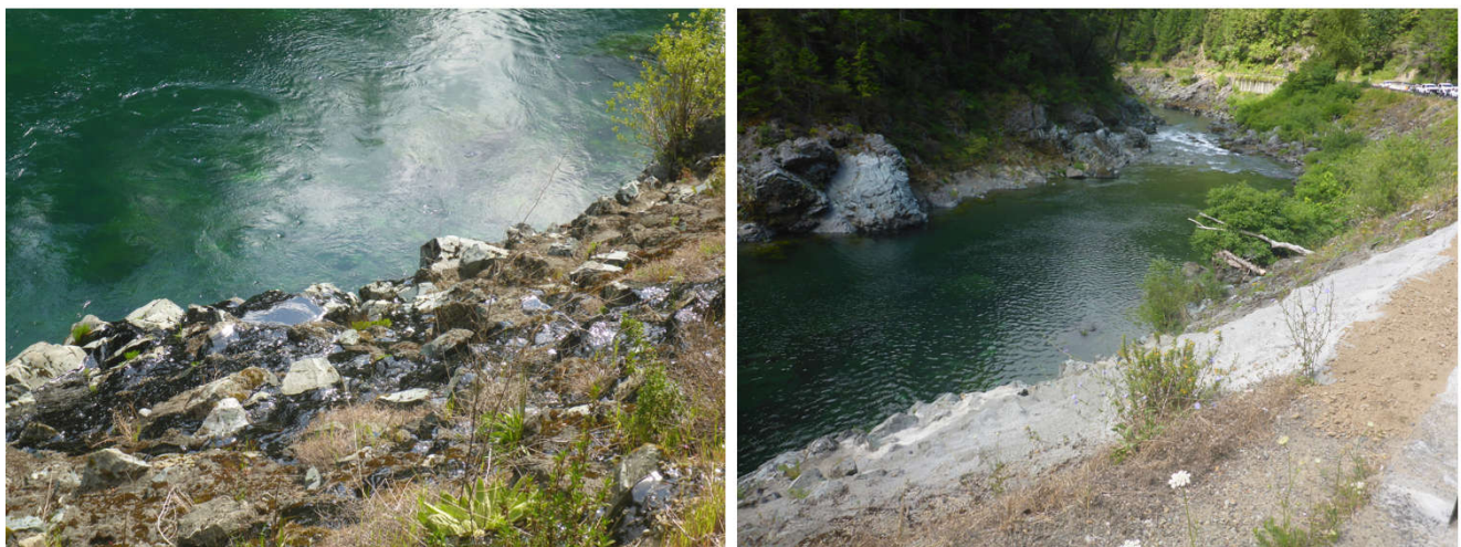
Spill Site - #1: View from Highway 199 looking down the slope at the Smith River.