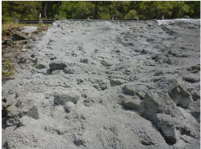
Spill Site - #3: View from the riverbank looking uphill toward Highway 199.