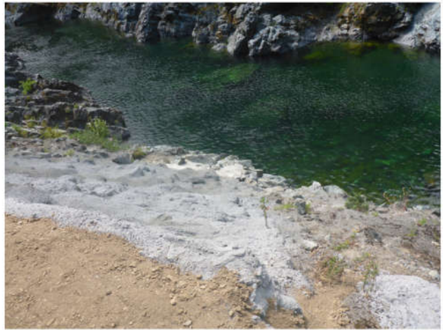
Spill Site - #2: View from Highway 199 looking downhill at the Smith River.